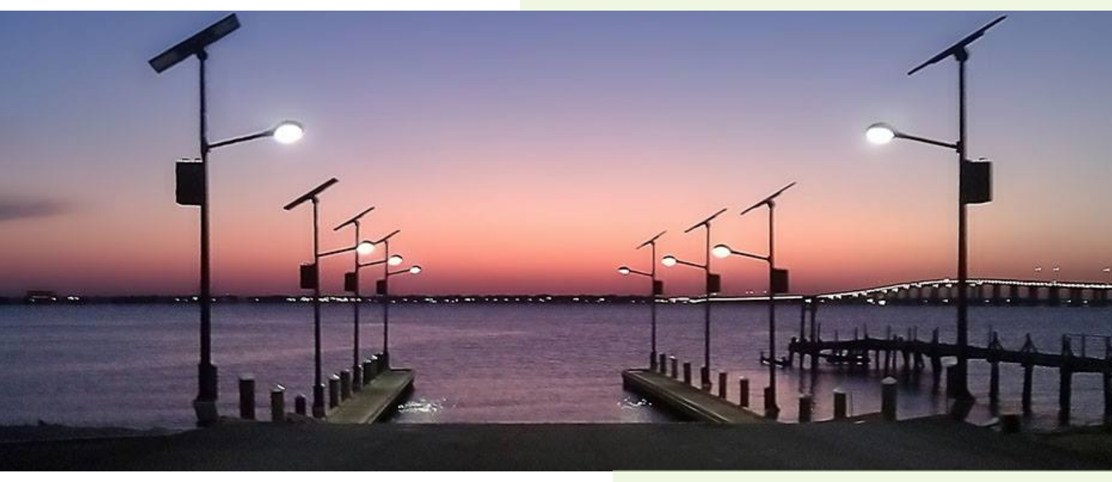
Installed in remote locations like boat ramps where running electricity if not economical

Discover how Eco Solar Lighting can power your next project efficiently and sustainably.