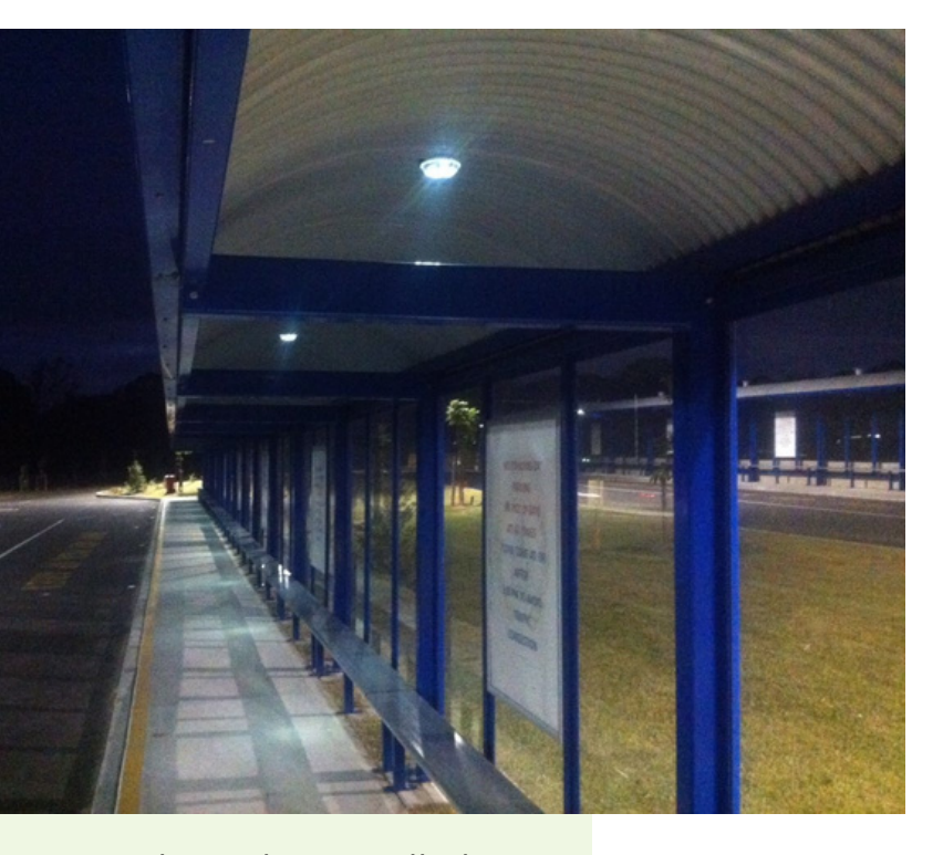
Eco Solar Lights installed into existing Bus Shelter