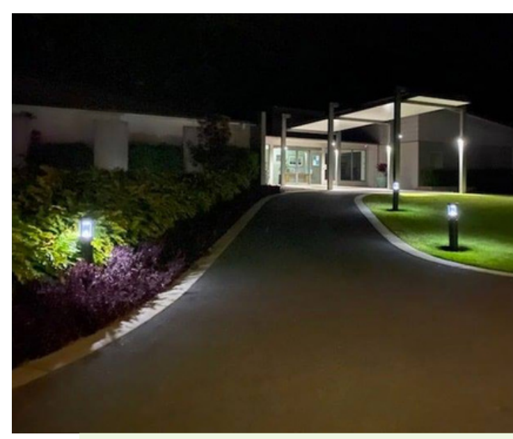
Driveway's and entrances to facilities