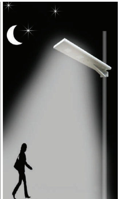
Full Power Lighting

Light automatically turns on to 1/3 brightness at dusk.