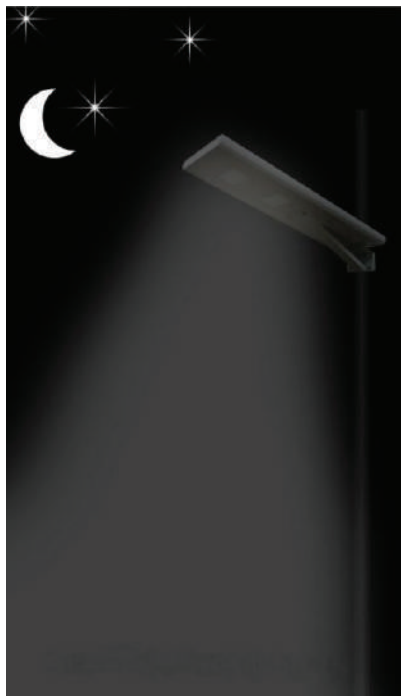
1/3 Power Lighting

Light switches to auto-off for charging by the sun during the day.